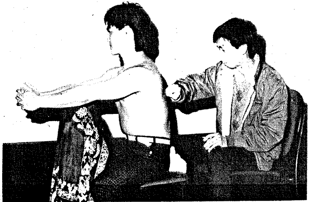
INDOCHINESE MEDICINE AT WORK