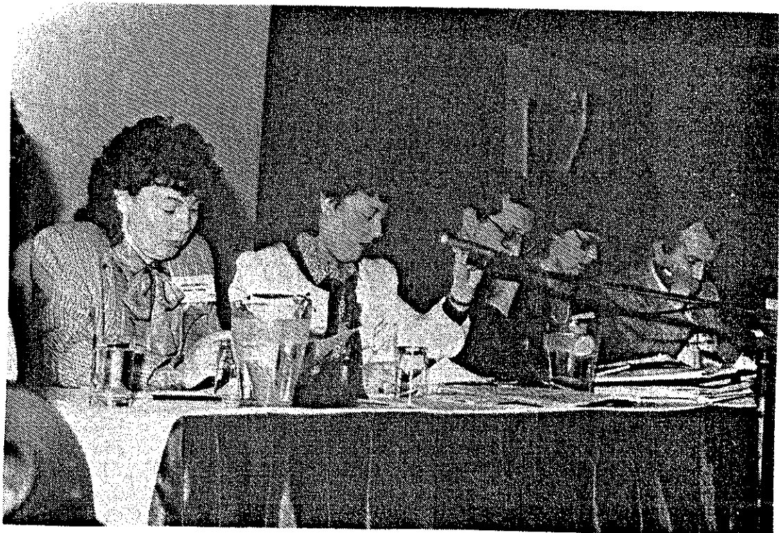
Eyes down The National Executive 1987 AGM