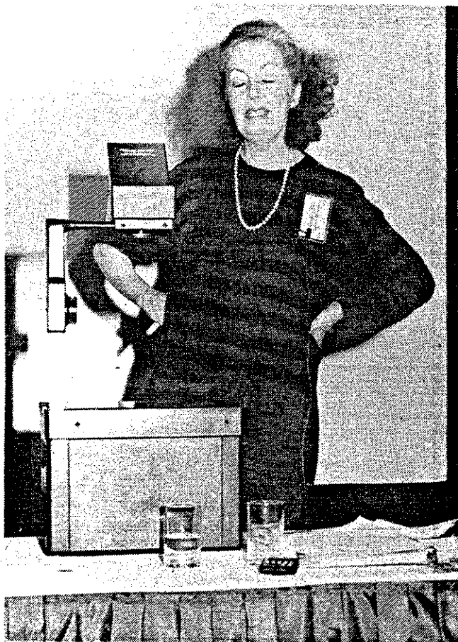
THAT GREAT STRATEGIC PLAN