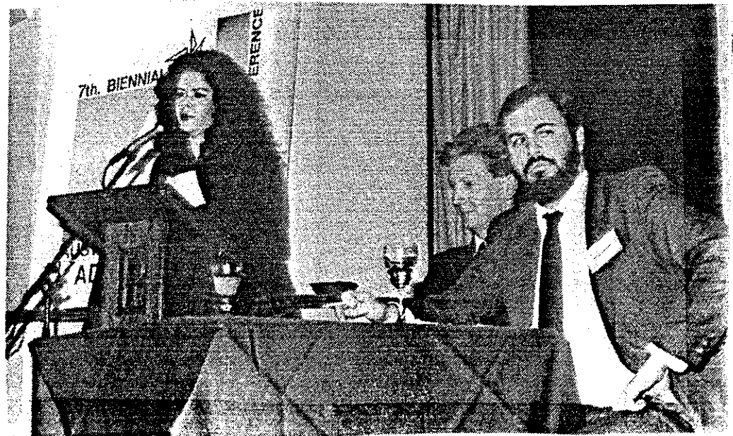
THE GREAT DEBATE